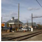
general overview of