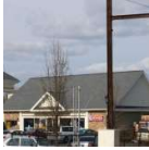
its at base of iron [ not